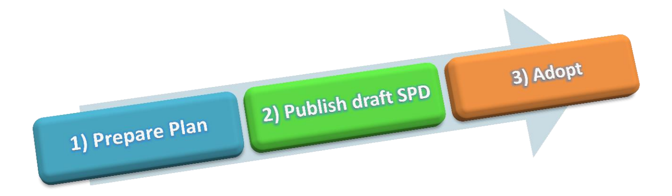
Figure 3: Stages in Supplementary Planning Documents