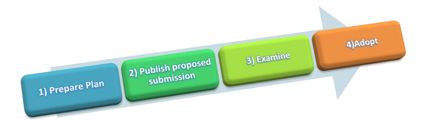
Figure 2: Stages in preparing the Local Plan