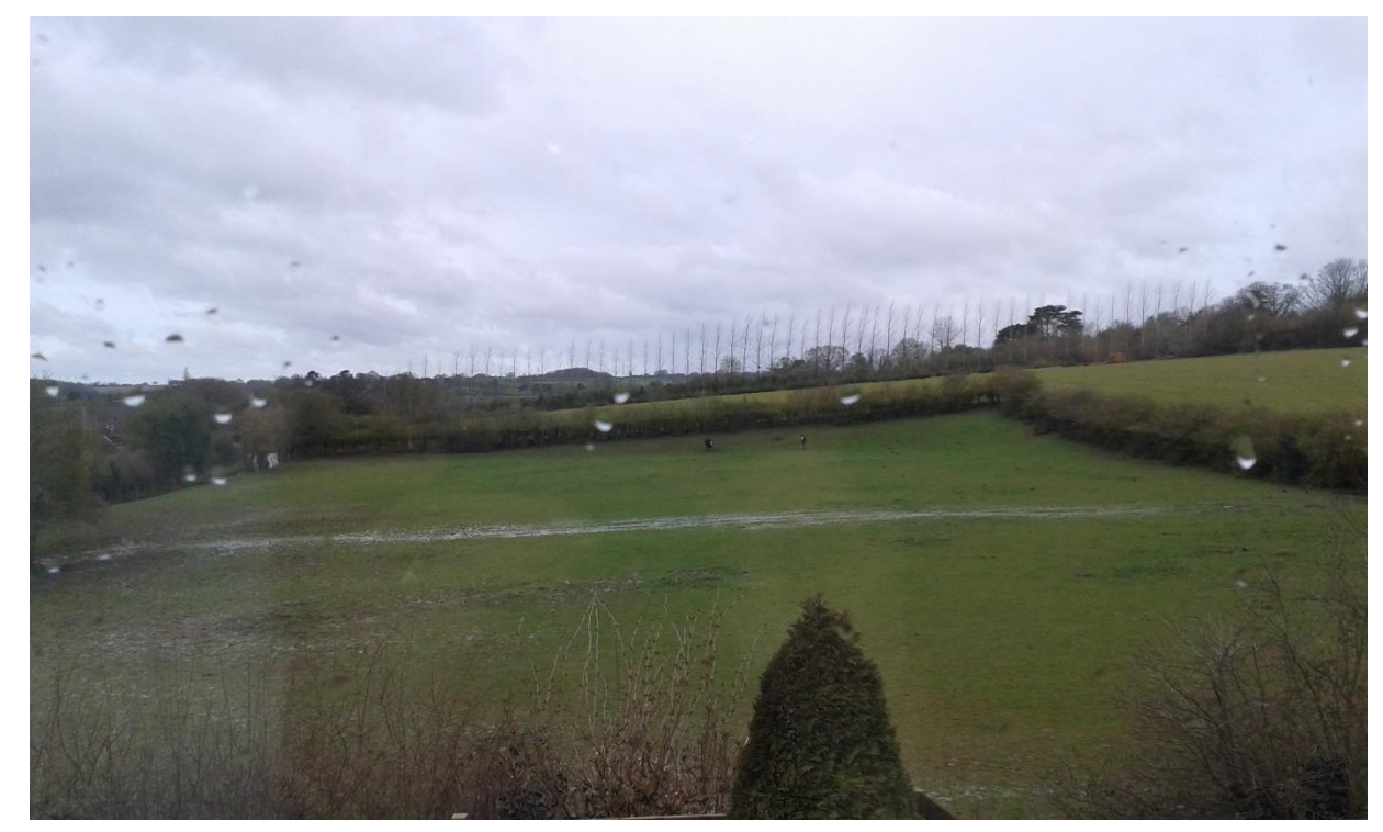
Figure 1 View of field in SE corner of LA3, looking west – March 2016

Link to Video on WHAG facebook page, showing flooding along Chaulden Lane – March 2016: