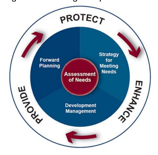
Figure 1: Planning for Sport model

As illustrated, Sport England regards an assessment of need as core to the planning for sporting provision. This report reviews indoor leisure sporting facility need in Dacorum and provides a basis for future strategic planning. The need for outdoor sports is considered separately.