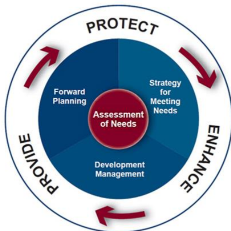
Figure 1: Planning for Sport model

As illustrated, Sport England regards an assessment of need as core to the planning for sporting provision. This report reviews indoor leisure sporting facility need in Dacorum and provides a basis for future strategic planning. The need for outdoor sports is considered separately.