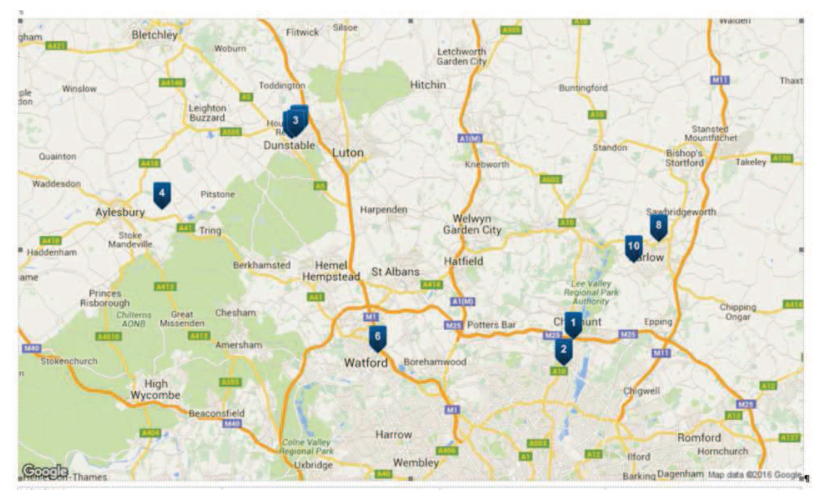
Figure 4.1 Location of current advertised large-scale units