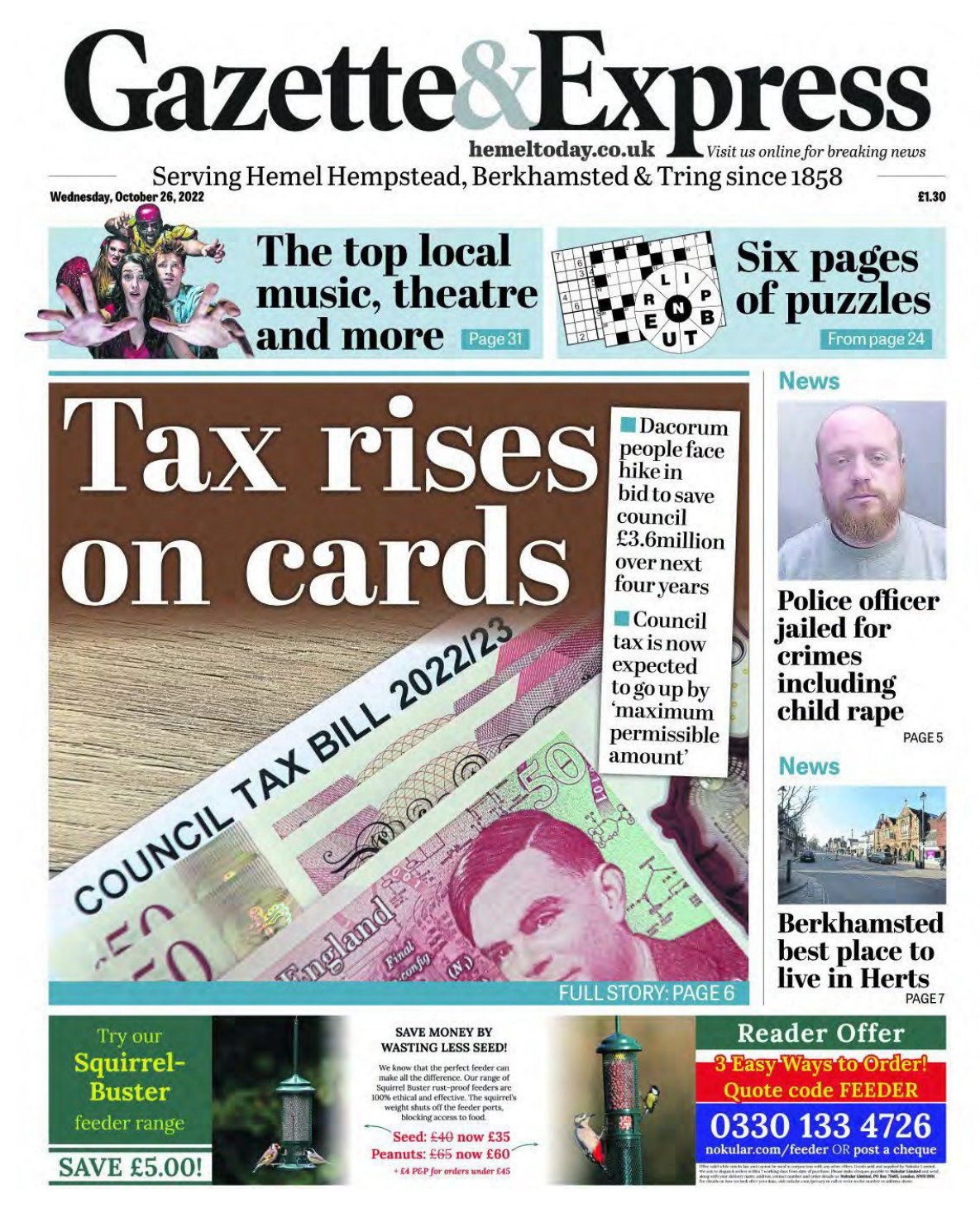
Figure 5: Front Page of Hemel Hempstead Gazette & Express, 26/10/2022