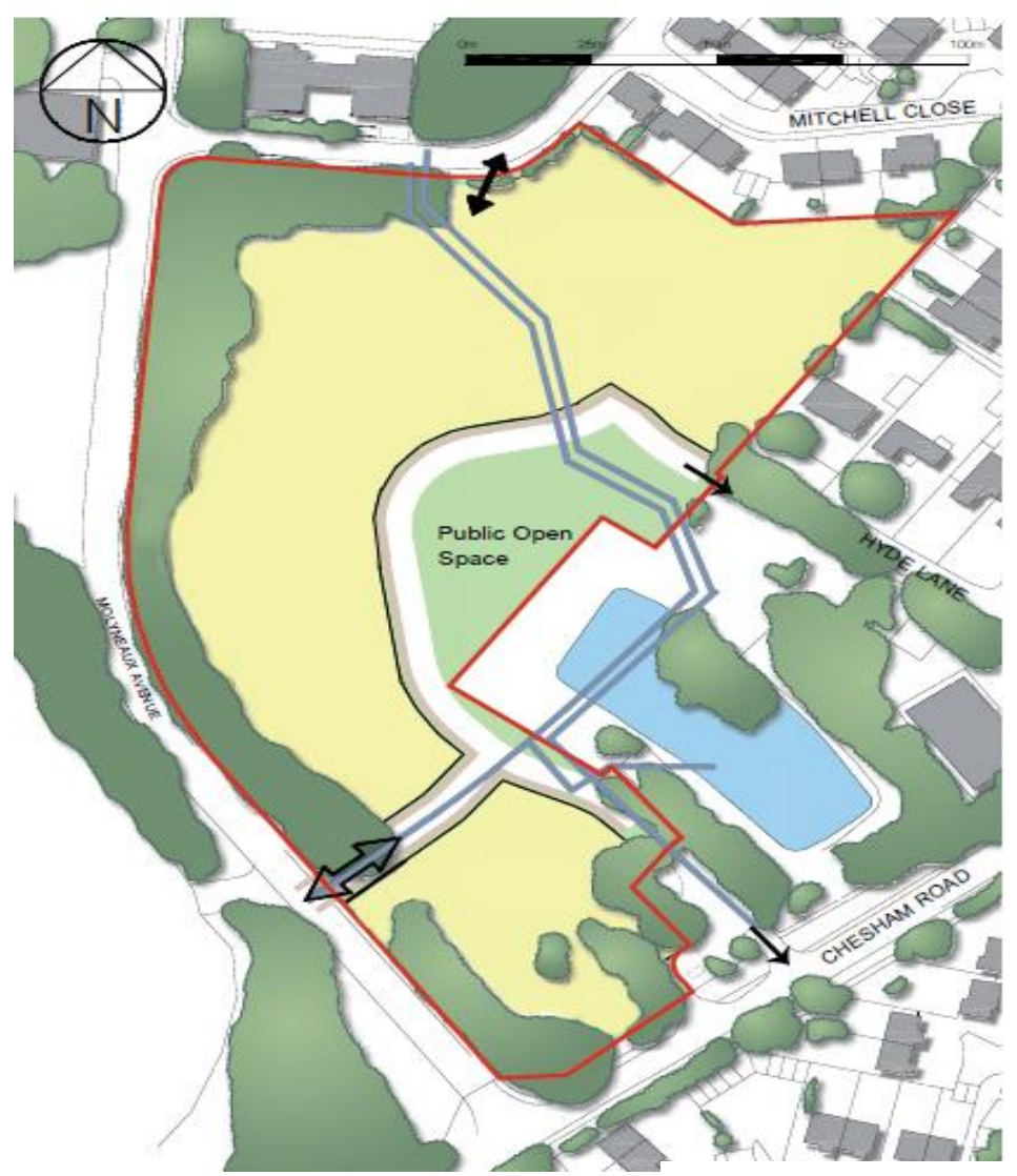
Figure 3:Masterplan Framework diagram

Taking into account the known constraints of this site identified within this report, the masterplan (Figure 3) demonstrates that it is viable to develop this site for residential uses.