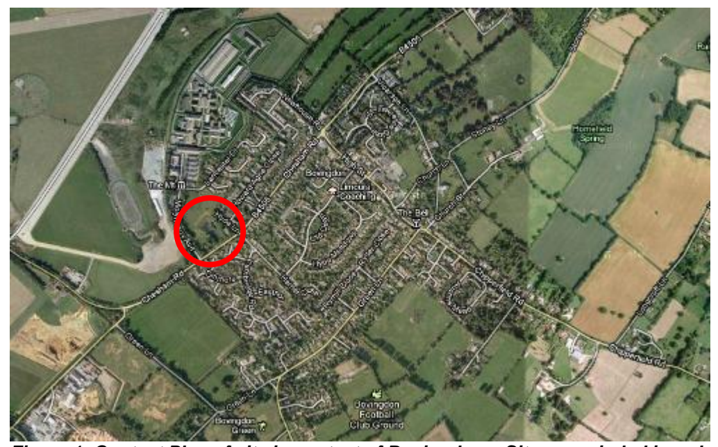
Figure 1: Context Plan of site in context of Bovingdon – Site area circled in red

Local Allocation LA6 is situated to the south of The Mount Prison and is separated from the prison itself by Molyneaux Avenue and Lancaster Drive. This area is referred to as "the site" within this statement (see figure 1).