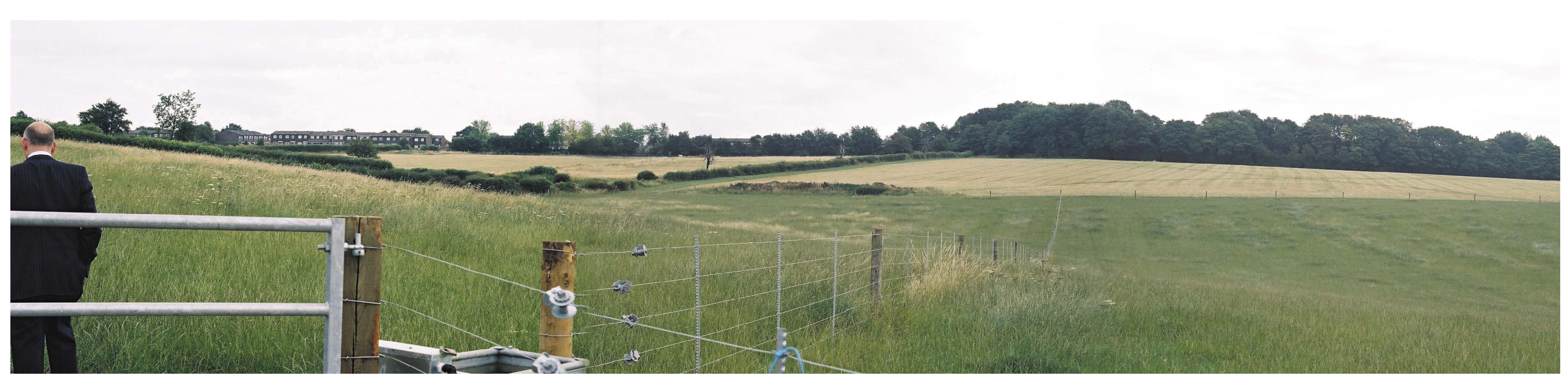
Photograph Viewpoint 5: View from the west of the site towards the urban edge of Grovehill, Hemel Hempstead (photograph taken in 2004)