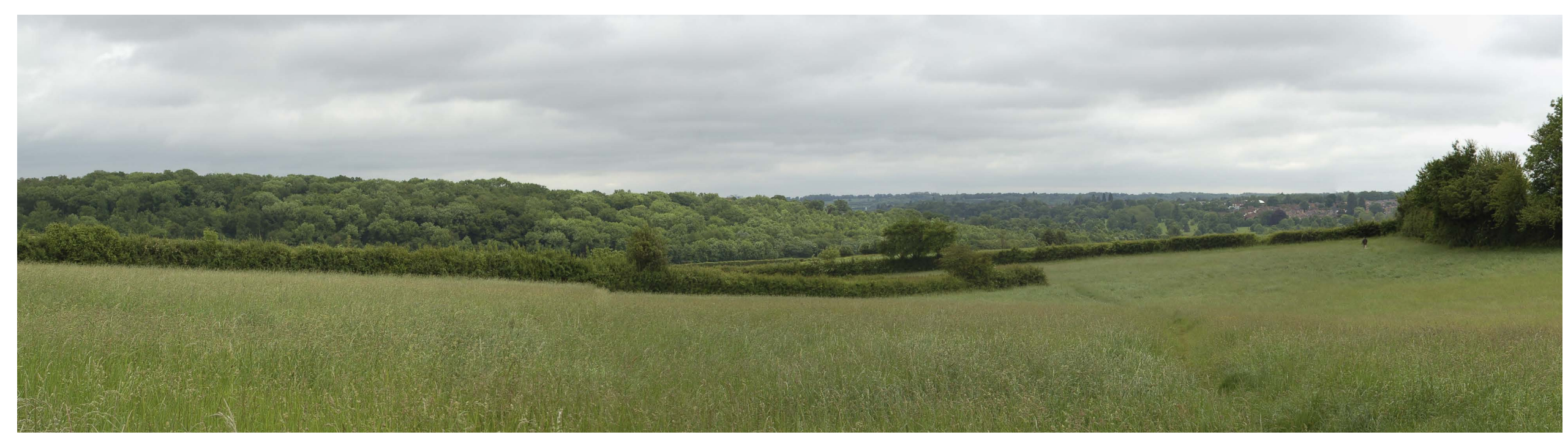
Photograph Viewpoint 8: View to the south west from the north of the site towards distant ridgeline of the Bulbourne Valley

ISSUED BY Oxford t: 01865 887050 DATE Aug 2012 DRAWN SMc