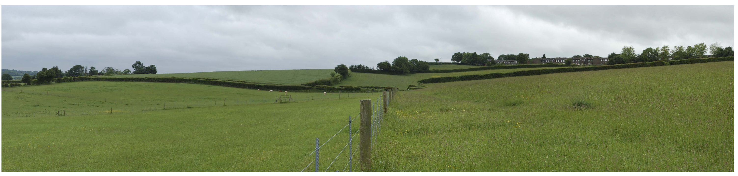
Photograph Viewpoint 7: View from the south of the site towards the north western site boundary