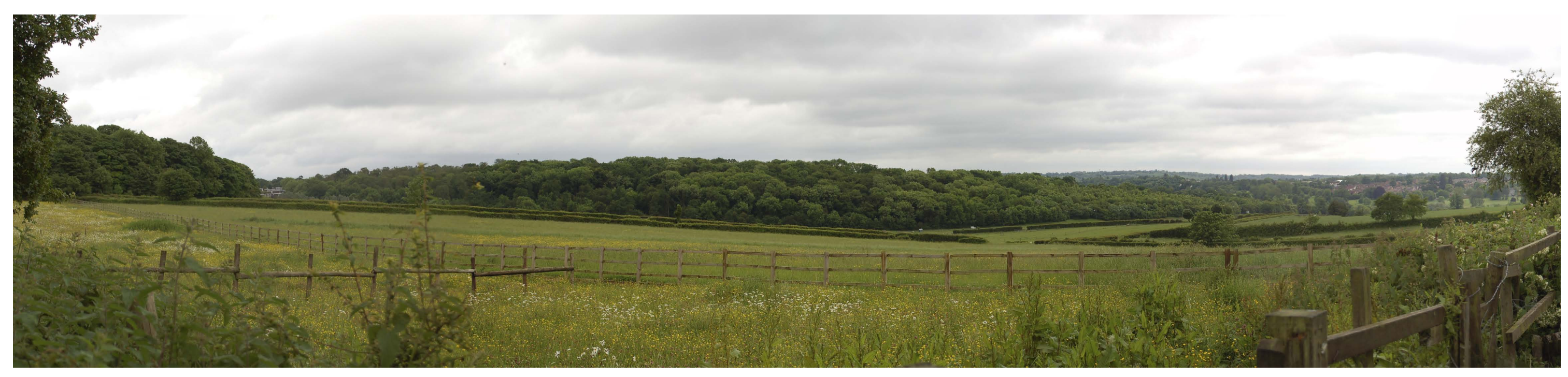
Photograph Viewpoint 6: View from the north eastern boundary of the site towards Howe Grove woodland