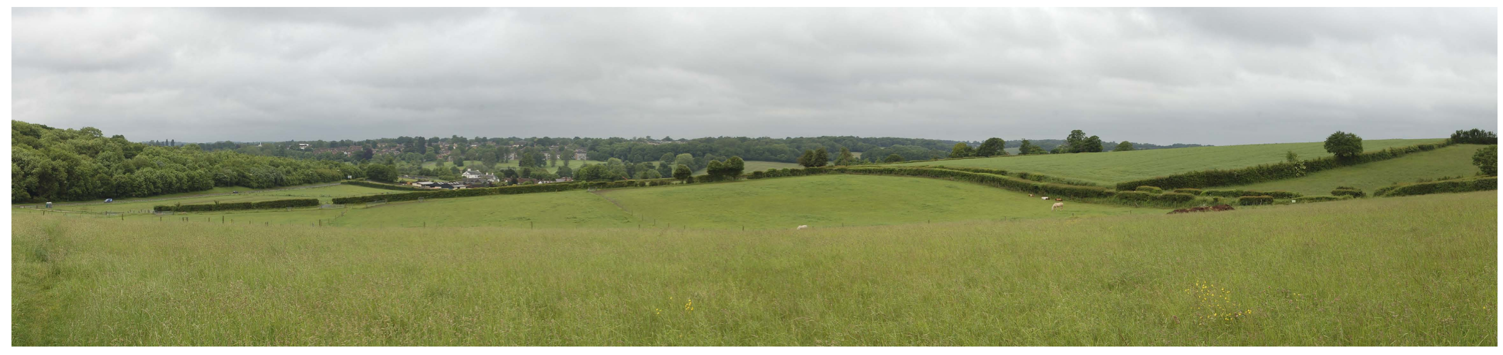
Photograph Viewpoint 4: View from the east of the site towards the opposite side of the River Gade Valley, including Gadebridge and Gadebridge Park

ISSUED BY Oxford t: 01865 887050 DATE Aug 2012 DRAWN SMc