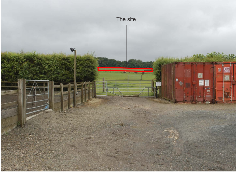
Photograph Viewpoint 13: View to the north east from the public footpath passing through Marchmont Farm looking towards the eastern site boundary