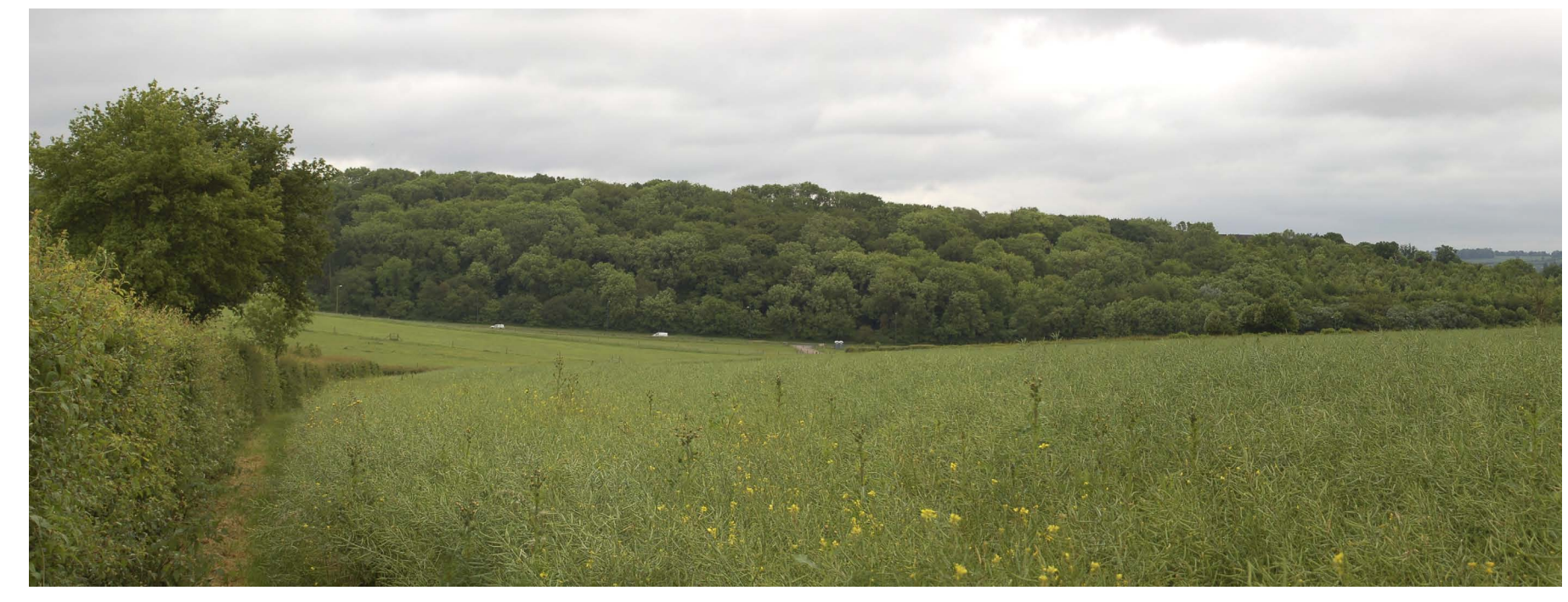
Photograph Viewpoint 12: View to the south east from the public footpath to Dodds Lane looking towards the south eastern portion of the site and Howe Grove woodland