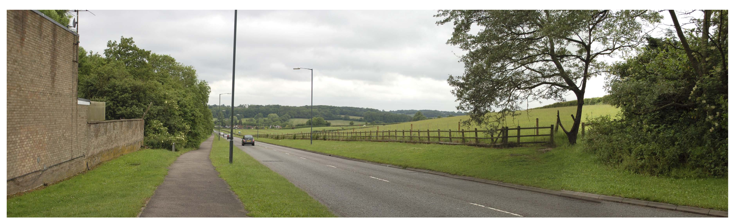
Photograph Viewpoint 10: View to the south west from the A4147 link road towards the south boundary of the site and the conservation area of Piccotts End

ISSUED BY Oxford t: 01865 887050 DATE Aug 2012 DRAWN SMc