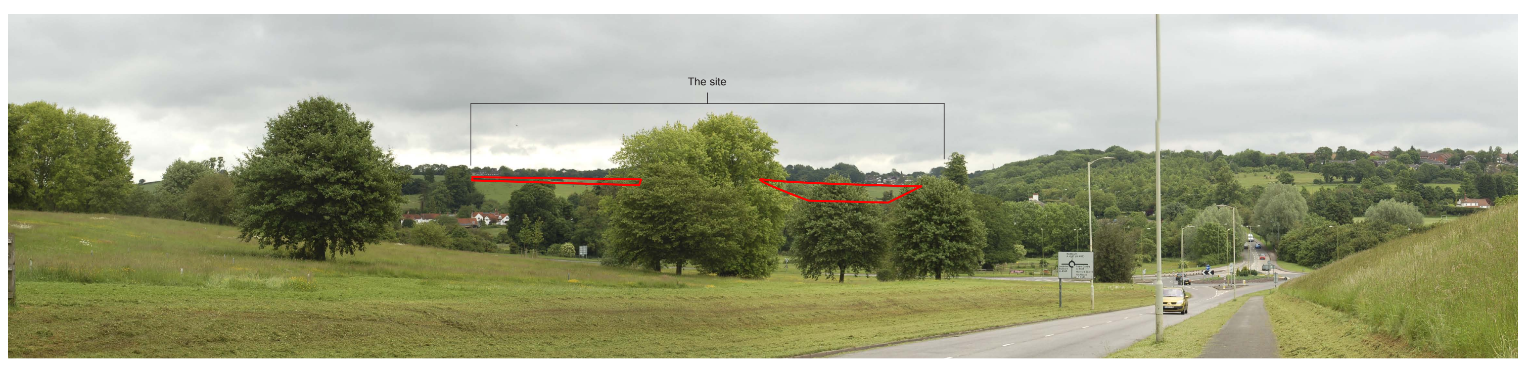
Photograph Viewpoint 9: View to the north east from Gally Hill Road towards the site