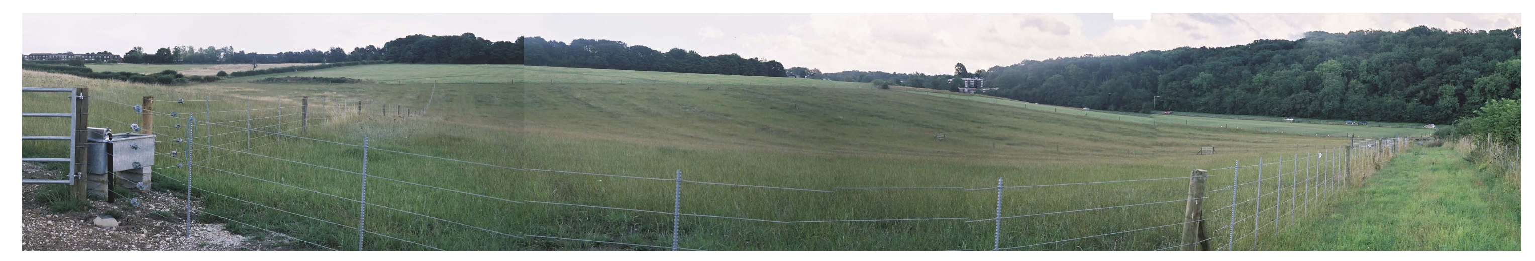
Photograph Viewpoint 2: View of site from south western site boundary (photograph taken in 2004)

ISSUED BY Oxford t: 01865 887050 DATE Aug 2012 DRAWN SMc SCALE@A3 NTS CHECKED KW