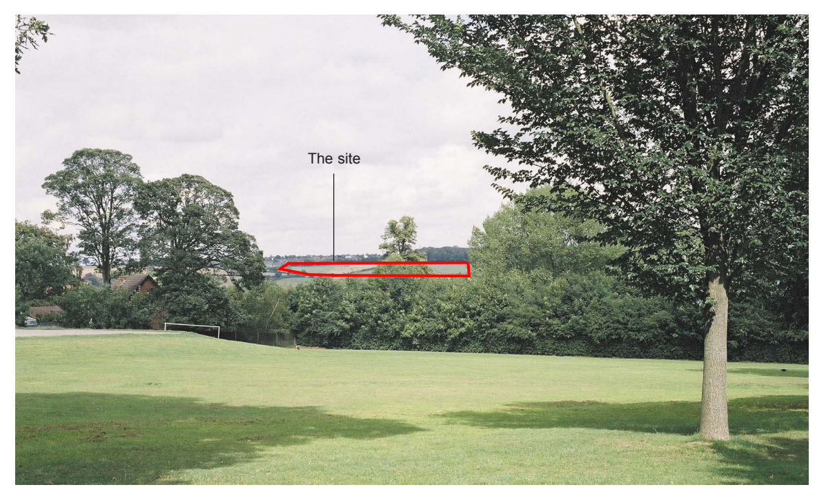
Photograph Viewpoint 15: View to the north east from Gade Valley Infant School towards the site (photograph taken in 2004)