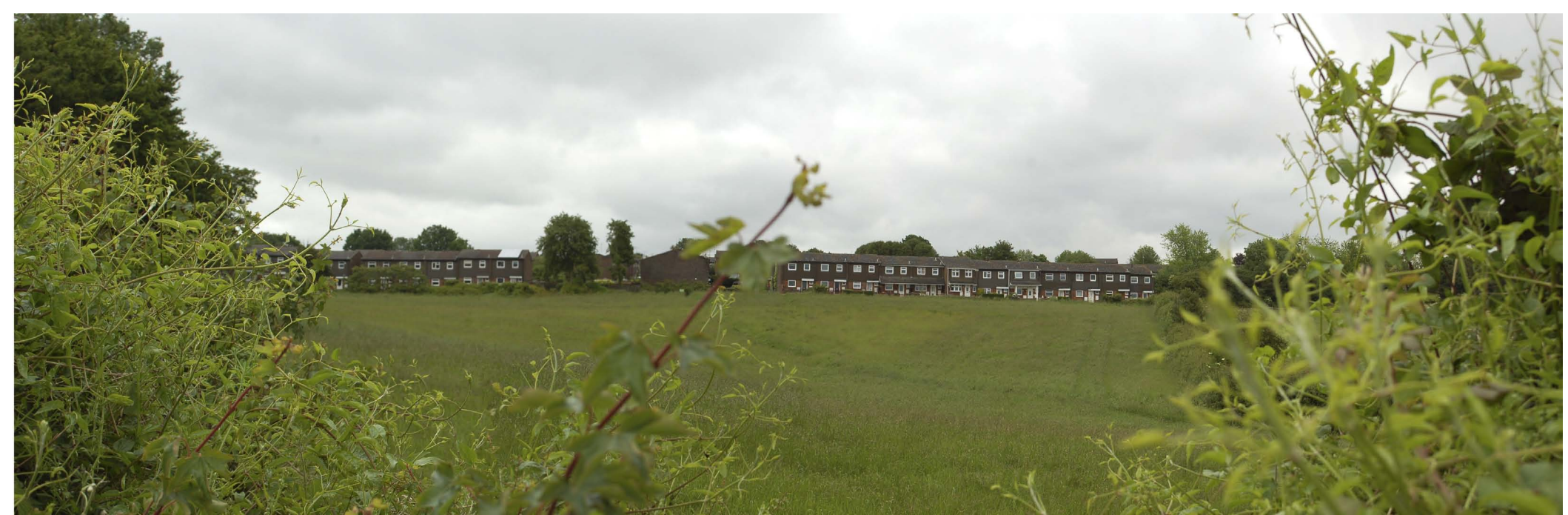
Photograph Viewpoint 1: View of north eastern site boundary from public footpath