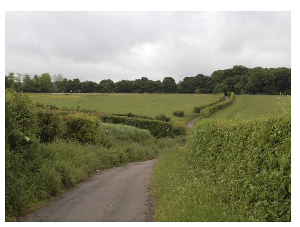
Photograph Viewpoint 11: View from the north east from Piccotts End Lane towards the north western site boundary