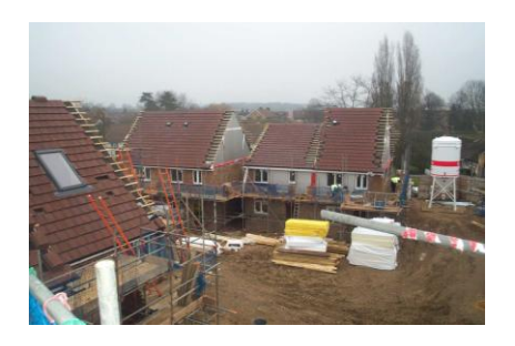
Final Assessment June 2012