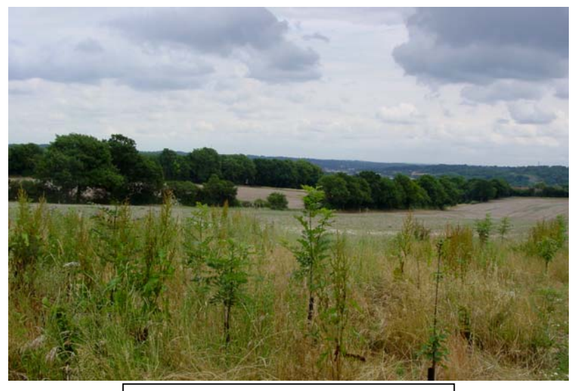
Pouchen End, Hemel Hempstead (site number 6)

Note: Greenfield sites are sites which are undeveloped. The term is used to describe the character, appearance and use of land: it includes playing fields, allotments, agricultural land and open space within towns and large villages, as well as within the countryside. Not all greenfield sites are within the Green Belt. Green Belt is a policy designation and is defined in the development plan: the Green Belt around Hemel Hempstead is part of the Metropolitan Green Belt. Its purpose is to prevent the merging of settlements and general encroachment of built development into the countryside. The Green Belt boundary can be reviewed through a review of the development plan.