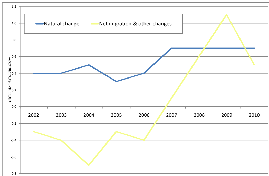
Figure 1: Components of population change in Dacorum, 2002-2010

Source: ONS mid-year population estimates: components of population change for Local Authorities in the UK. Available at http://www.statistics.gov.uk