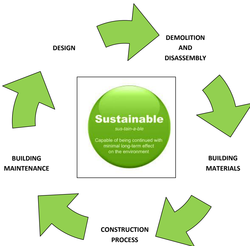
Figure 2: Components of Sustainable Design and Construction

3.1.2 Precise requirements will depend upon the type and scale of development proposed. Further advice relating to different types of development is set out below.