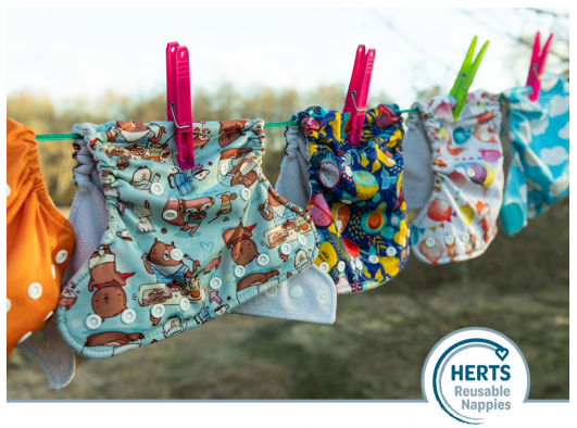
HELP CHANGE NAPPIES IN HERTS

Find out more here: https://www.dacorum.gov.uk/realnappies or call 01442 228000 and ask for "Waste Services".