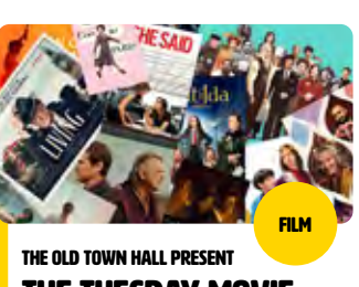
THE TUESDAY MOVIE

EVERY TUESDAY 14:00* & 19.30 *FREE MATINEE TEA & COFFEE